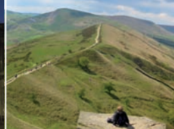
Peak District-Mam Tor