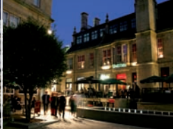
Sheffield by night