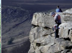
Peak District-Stanage Rocks*