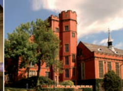
The University of Sheffield