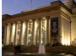
Sheffield City Hall*