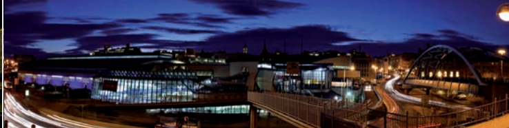
Sheffield by night*